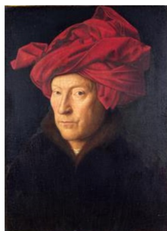
Jan Van Eyck "Portrait of a man" 1433

MANKIND wants to inspire artists by offering them the best in audio-visual technology, with the addition of motion. The result is a choreography of screen movements that tell a unique story.